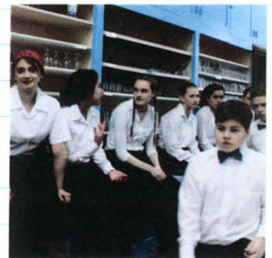
Students take advantage of a short break during the Auction.