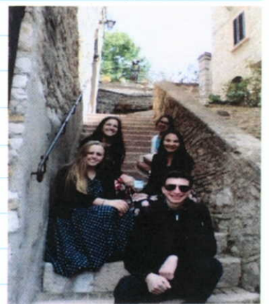
A group photo on one of the lovely